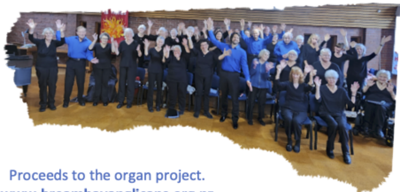
FOTO Members - $5; Adults - $10; Children (13 and under) free. Door sales only.

Proceeds to the organ project. www.breambayanglicans.org.nz